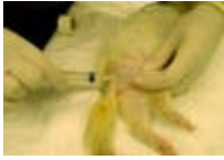
Figure 1b. Intraosseous catheterization in a ferret (see text for details). - To view this image in full size go to the IVIS website at www.ivis.org . -

Pre-anesthetic preparation will vary depending on whether anesthesia is for an emergency or routine procedure. However, even in an emergency situation, obtaining the maximum amount of information prior to anesthetizing the animal is recommended.