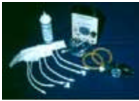
Figure 6. Doppler device made by Parks Medical Electronics ( www.parksmed.com/products/non_dir.php ). This unit is the 811 series commonly used in veterinary medicine. - To view this image in full size go to the IVIS website at www.ivis.org . -

A Doppler flow monitor (Fig. 6) with the probe secured over the medial aspect of the elbow will allow for continuous monitoring of pulsatile blood flow in a peripheral artery, and of the heart rate and rhythm as well as an estimation of arterial blood pressure if it is used in combination with a cuff and sphygmomanometer. Temperature should be recorded regularly even after the animal is draped and under going surgery. An electrocardiogram can provide useful information if there is room on the patient or if a Doppler is not available. The measure of the hemoglobin saturation in oxygen can be obtained with a pulse oximeter. Although debatable, this instrument may be of limited value because the probes are difficult to stabilize on these small patients, and this technique has not been validated for these species. Active monitoring and early detection of complications and intervention are keys to successful anesthesia.