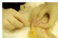
Figure 1a. Intraosseous catheterization in a ferret (see text for details). - To view this image in full size go to the IVIS website at www.ivis.org . -

Ideally all patients should be stabilized prior to anesthesia. However, vascular access can be very difficult, but even in patients difficult to catheterize, intraosseous catheterization is possible (Fig. 1a and Fig. 1b). Intraosseous catheterization is performed in anesthetized animals, or is performed with a local block in moribund animals. The hip and the base of the tail are clipped and prepared as for surgery. Wearing sterile gloves, the clinician palpates the greater trochanter (some authors report using an approach via the trochanteric fossa). A 22 gauge 1 - 1.5 inch spinal needle is inserted into the femur using a light rotation movement of the needle (along its long axis). The needle should be kept parallel to the long axis of the femur to avoid accidentally exiting through the cortex of the bone. Once the needle is in place, the stylet is removed and 0.5 - 1ml of sterile saline is injected slowly. If swelling of the surround thigh tissues occur, the needle has traversed the cortex distally and should be withdrawn or repositioned. Two radiographs showing orthogonal views of the femur will confirm proper positioning of the needle. An injection cap or a fluid administration set can then be attached directly to the needle. Antibiotic ointment and a light bandage are applied.