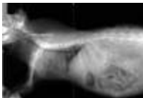
Figure 2a . Rabbits have a small thoracic cavity that can be compressed easily by dilation of abdominal viscera (gas accumulation from any source) or inappropriate positioning. In radiograph A, the rabbit is in lateral recumbency with its body extended. - To view this image in full size go to the IVIS website at www.ivis.org . -

Intubation is challenging but not impossible. However, repeated attempts and the resulting laryngeal trauma during intubation attempts often result in swelling and respiratory obstruction during the peri-anesthesia period.